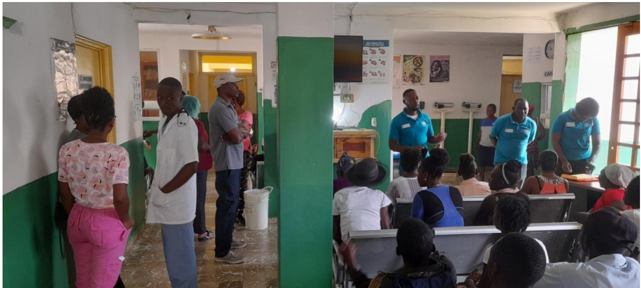
A cholera education activity for patients in the waiting room .Since December 2022 we had had many cases of cholera in the community .