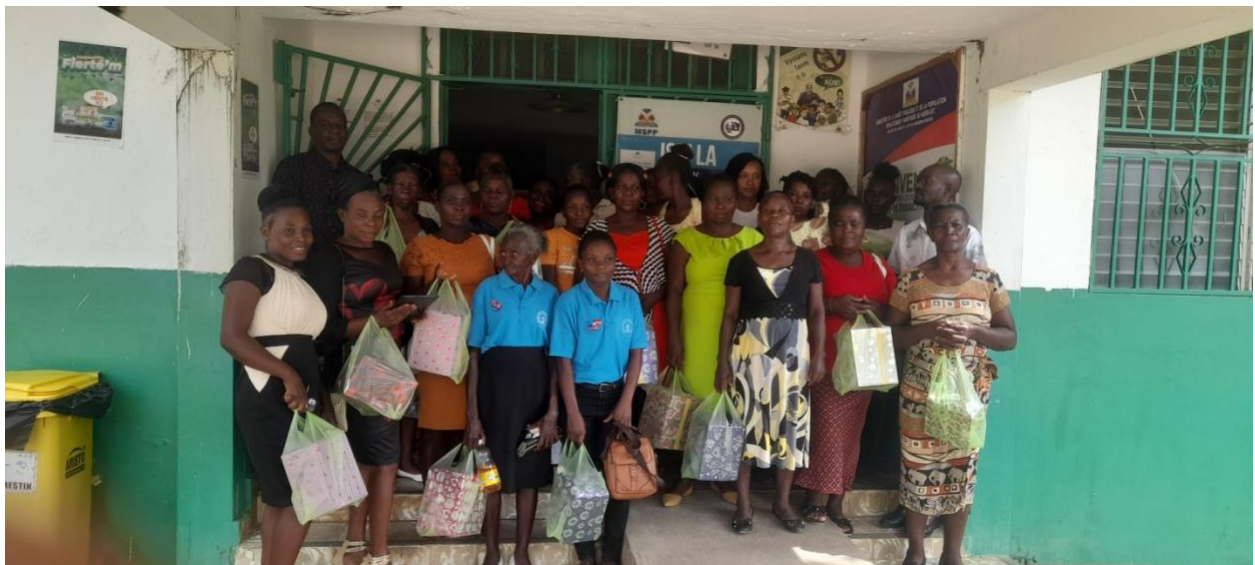
An activity organized during the past quarter on the occasion of mother's Day . The staff took the opportunity to give small gifts to encourage them and to mark the date .