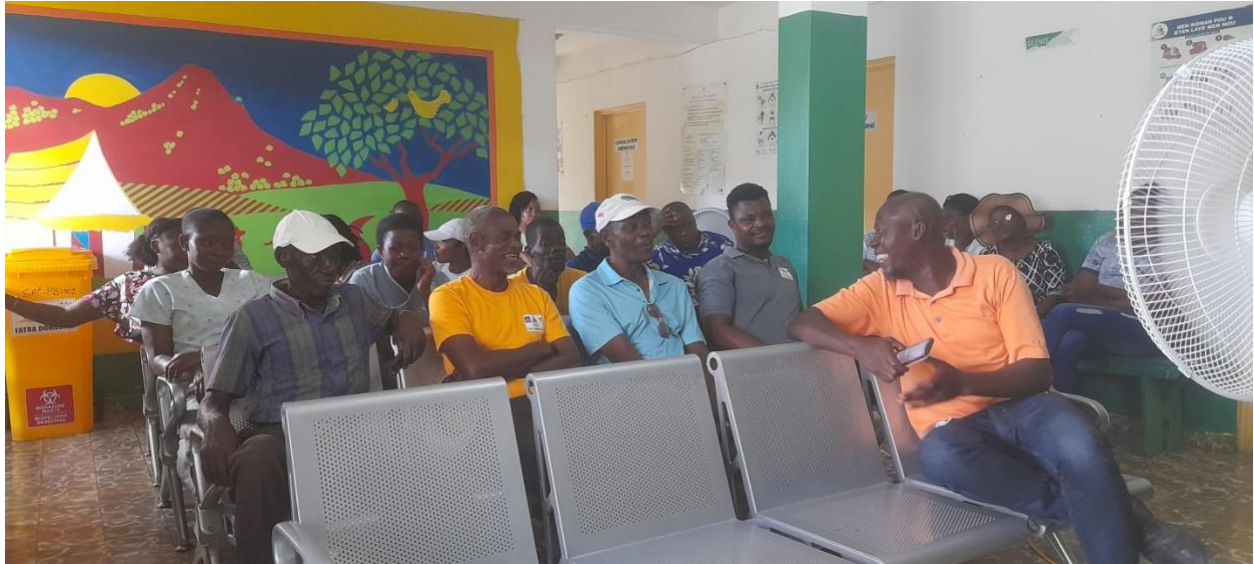
Photo showing a meeting with employees ,an activity carried out once a month to review the functioning of the center in order to identify strengths and weaknesses and submit recommendations to correct weaknesses.