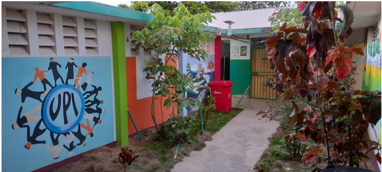
A beautiful view of the health center, a part with the VPI logo to show our grateful.