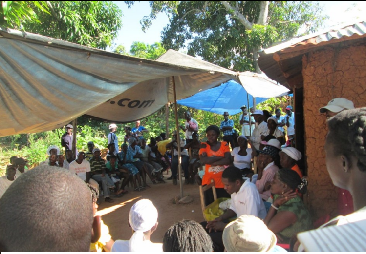
Mombin Medical Clinic in Haiti Serving more than 200 patients each month