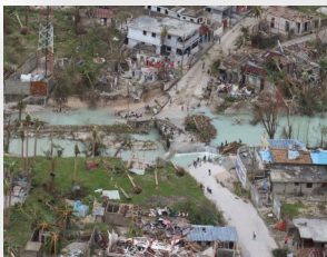
Relief for victims of Hurricane Matthew in Haiti