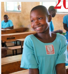
Anti-malarial meds for school-aged children in Uganda