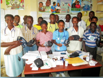
Mombin Hospital Health Care Staff