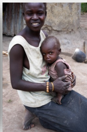
Maternity care and nutritional support for infants in Uganda