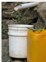
Repairs for water sources in remote Haiti