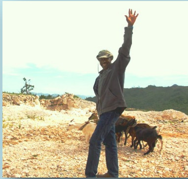
A farmer in Haiti receives goats to help rebuild his herd after losing his livestock in Hurricane Matthew.