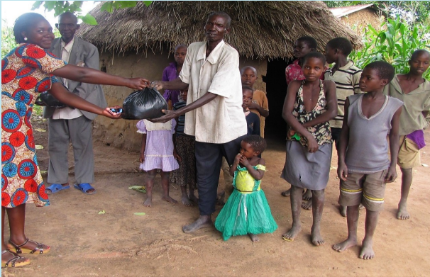
Community Health Workers in Papoli, Uganda distribute rice to families suffering during extreme drought and famine.