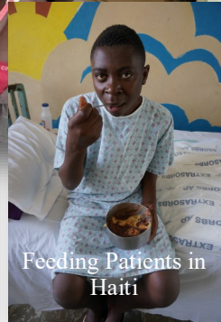
Feeding Patients in Haiti