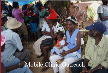
Mobile Clinic Outreach