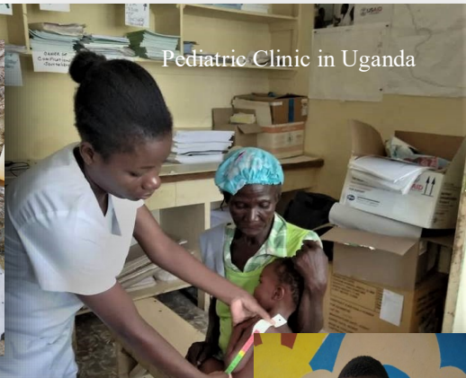
Pediatric Clinic in Uganda